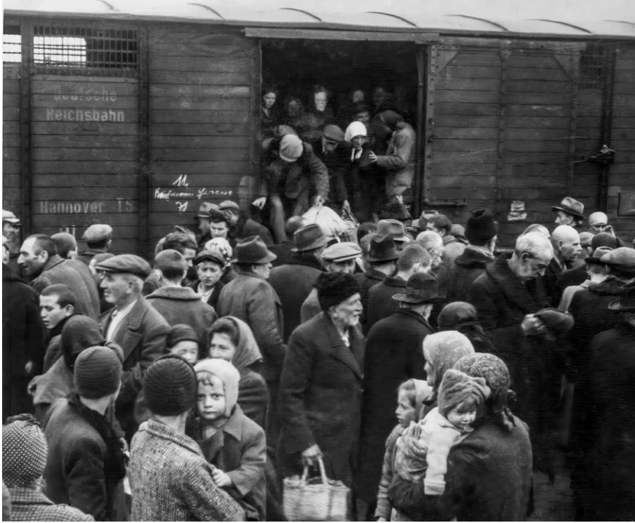
Arrival of a deportation train at the Auschwitz-Birkenau concentration camp, 1944.