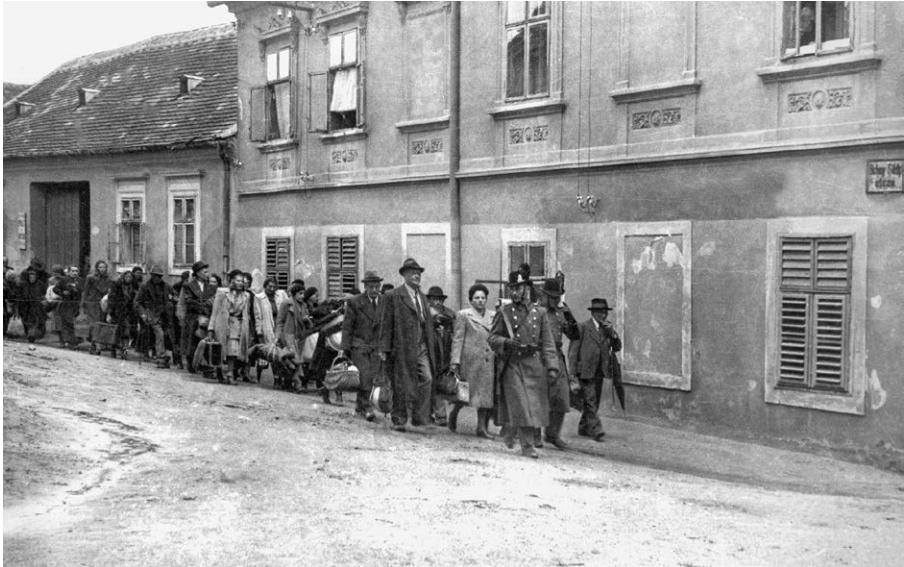
Jews walking from the Kőszeg ghetto to the railway station on June 18, 1944. After their transfer to the Szombathely collection camp, the prisoners were deported to Auschwitz on July 4, 1944.

their Latvian and Ukrainian helpers. It was clear that our dear policemen took part in the slaughter... but normal Poles took part as well.” 75