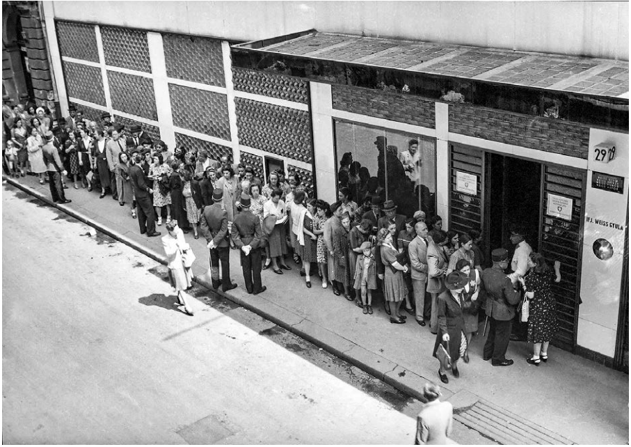
Queuing in front of the “Glass House,” the Swiss Embassy’s Emigration Department for Representing Foreign Interest. Budapest, 1944.

respected my history as a sportsman, and therefore saved all the infirm from being shot in the head as well.” 57