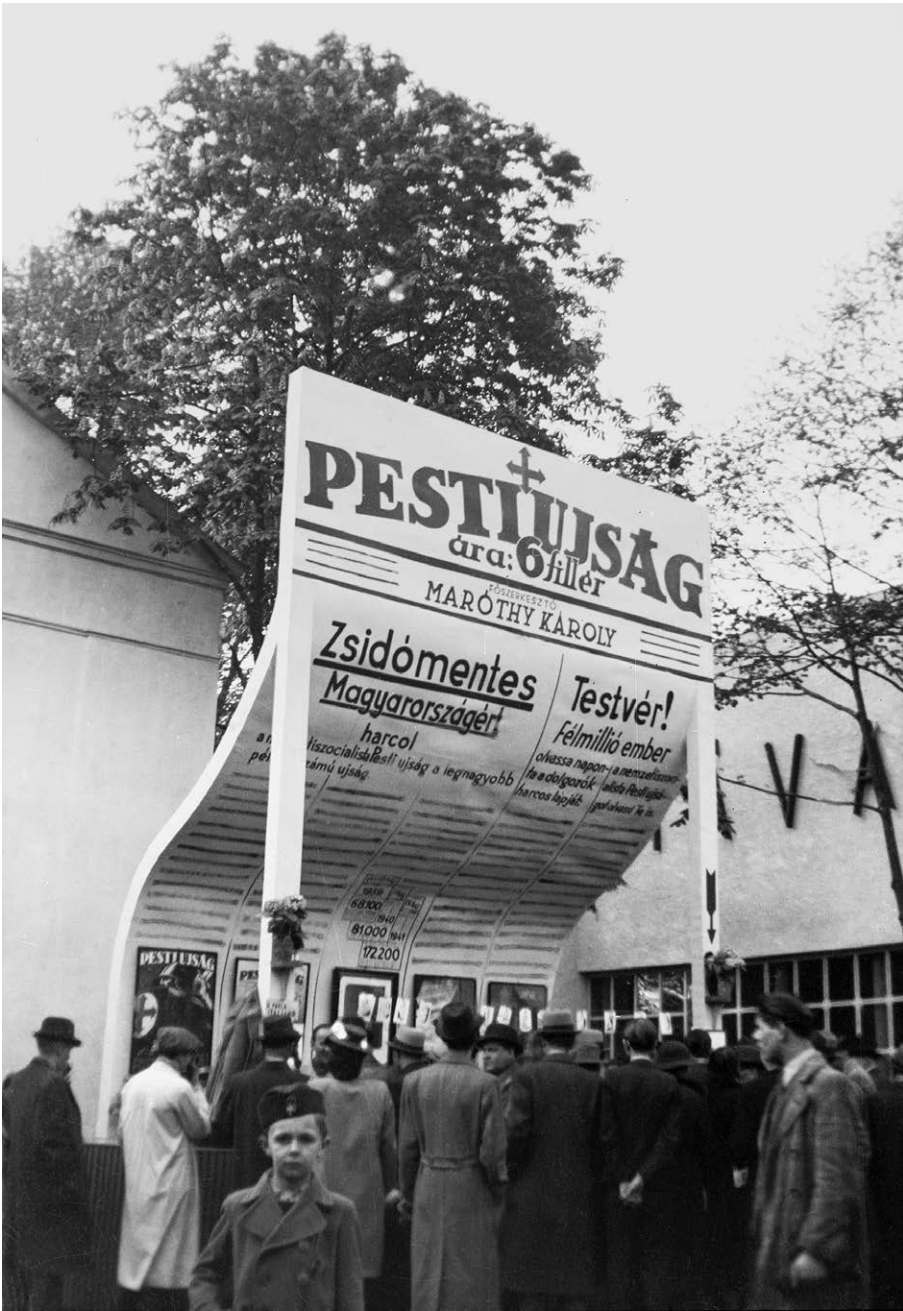
The pavilion of the far-right newspaper Pesti Újság at the Budapest International Fair, 1941.