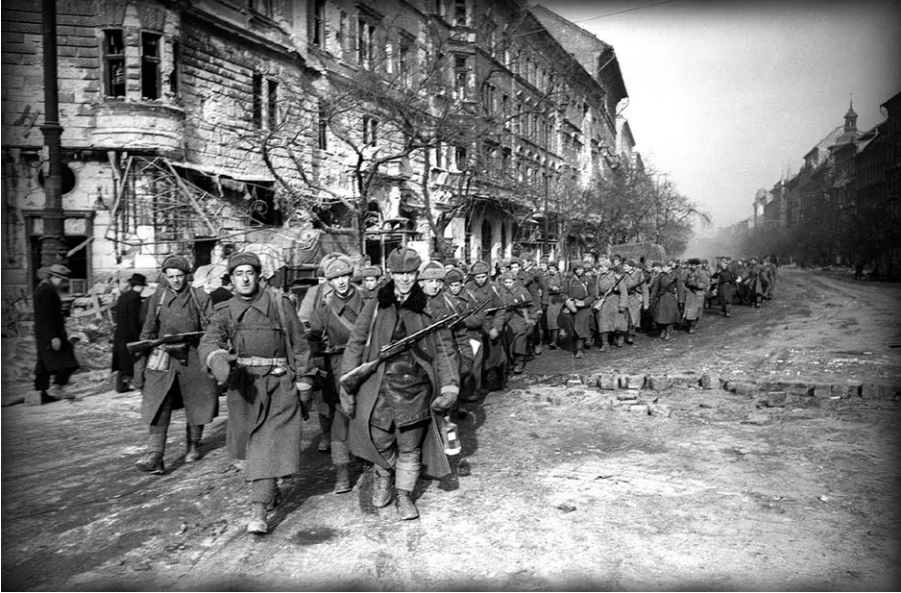
Red Army soldiers on József Boulevard in Budapest, 1945.