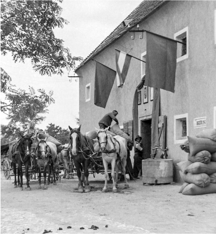
Collection of grain, Polgárdi, 1950.