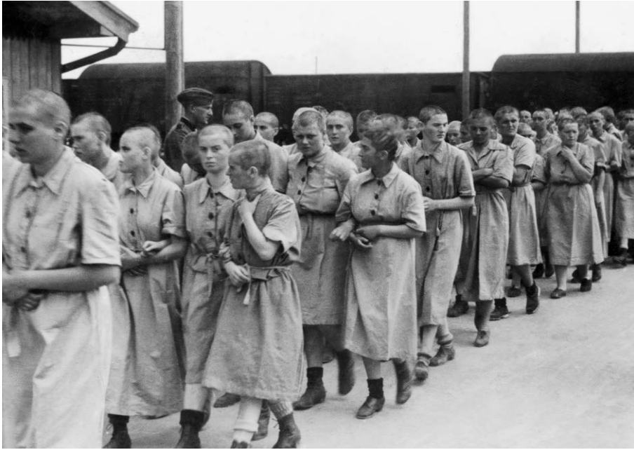
Female prisoners deemed fit for work, shaved bald and wearing a uniform, in the Auschwitz-Birkenau concentration camp, 1944.