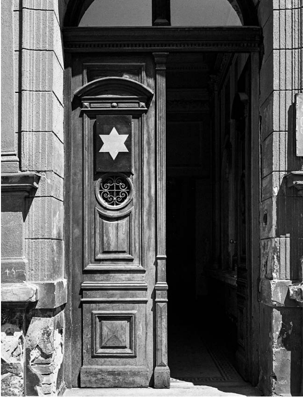
Entrance of a yellow star building, Budapest, 1944.

goodwill and understanding.” 74 Thus, the overwhelming evidence suggested that, despite her possible failings, she did in fact rescue people.