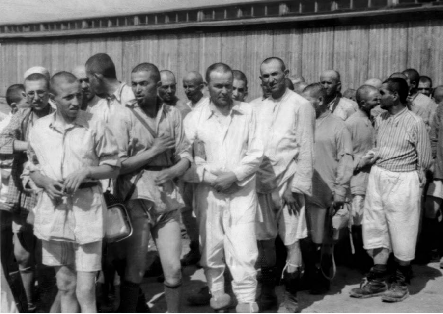
Male prisoners deemed fit for work, shaved bald and stripped to shirt and trousers, in the Auschwitz-Birkenau concentration camp, 1944.