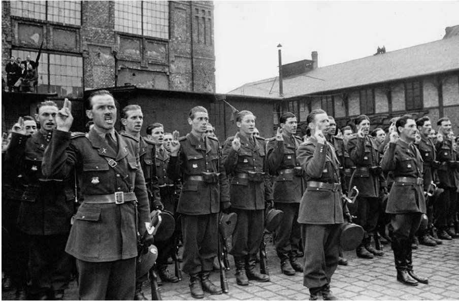
Oath taking ceremony of ÁVH officers April 25, 1949.

Rewards were offered for those who denounced alleged culprits, although the efficacy of this tool was mitigated by the fact that collecting a reward required going through a long, cumbersome bureaucratic process. Severe punishment was envisioned, particularly for killing calves and cattle, the perpetrators of which would be sent to jail automatically, although “social and class conditions” were to be taken into account in meting out the sentences. In spite of an inundation of decrees aimed at curbing illegal slaughter, the number of animals killed illegally was on the rise. This suggested that “control was very lax.” Therefore, the Ministry of Interior, aiming to increase the number of denunciations, instructed local councils to “mobilize wide masses” to curb black-market slaughter. State control of local authorities was tightened: the local council was mandated to maintain continuous control over activities designed to cut illegal slaughter. Statistics regarding repressive measures against black-market slaughter reveal that all social strata of the peasantry were repressed. In fact, more, “poor” peasants were prosecuted than “middle” peasants or kulaks. 204 In some places,