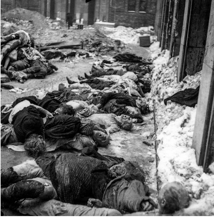
The corpses of Jews lie in the courtyard of the Dohány Street Synagogue, Budapest, 1945.