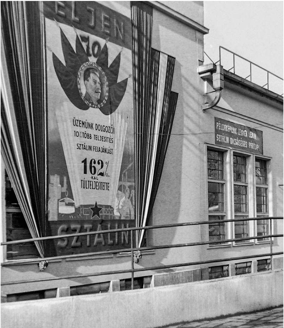
Decoration on the occasion of Stalin's 70th birthday at National Car Repair Company No. 2, 1949.