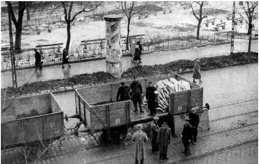
Transporting naked corpses from the Pest ghetto via tram tracks to the Forensic Medical Institute, Budapest, 1945.