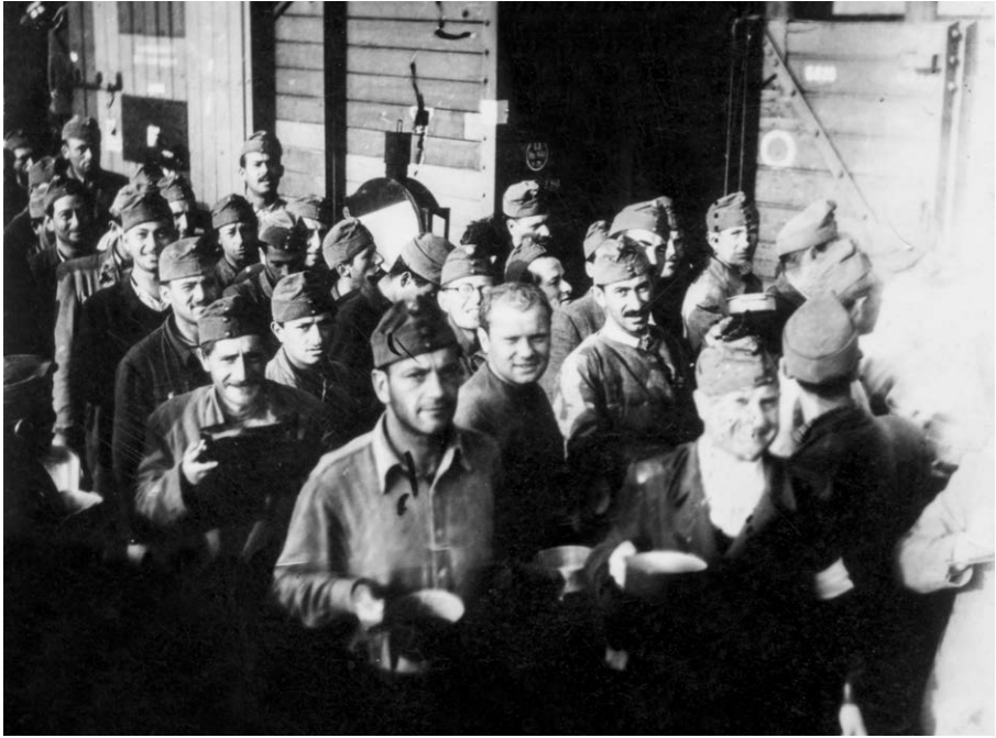
Lunch distribution for forced labor servicemen, 1944.

work could be equally arduous. In Javosno, after the prisoners had been forced to work through the day carrying 160-pound iron rods for twelve hours and had endured the constant bludgeoning which the Polish kapos had been meting out, the SS unleashed their dogs on them while they were walking home. 348