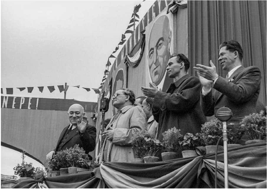
The party elite watches the May Day parade on Heroes Square, Budapest, 1947. From the left: Mátyás Rákosi, Árpád Szakasits, László Rajk, and György Marosán.

security for the individual. Defenselessness against the abuses of the state apparatus—and here I mean not only the apparatus of terror but all state agencies including local governments, school authorities etc.—was the most important trait of the Stalinist system. It is not that everyone could become a victim of abuse of power, but that there was no mechanism with which to rectify abuses. I also do not think that top level apparatchiks and the average citizen should be grouped together. True, even the most powerful [with the exception of the party leader] could become a victim, but only because they were part of an ongoing power struggle. In that sense at least they were “guilty” while the vast majority, totally excluded from wielding political power, were innocent.