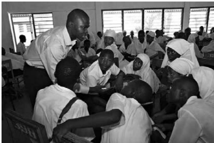
Figure 3 Secondary school students and instructor at a human rights workshop in Port Loko, Sierra Leone, 2009

The 1977 student intrusion into politics had limited gains. If anything, it served to revive a government under crisis but also opened up the possibility of sustained and organized opposition outside formal structures (emphasis added).