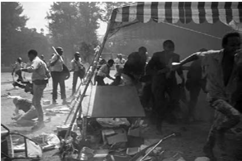
Figure 13 Police attack mothers and supporters protesting for release of political prisoners, Nairobi, Kenya, 1992