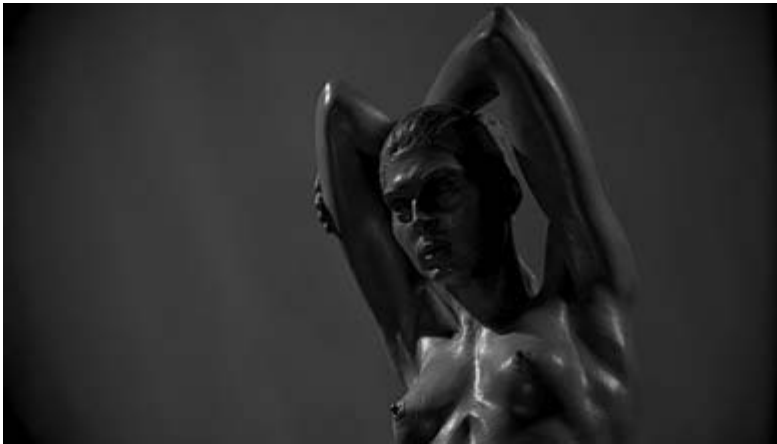
The first two shots of the show.