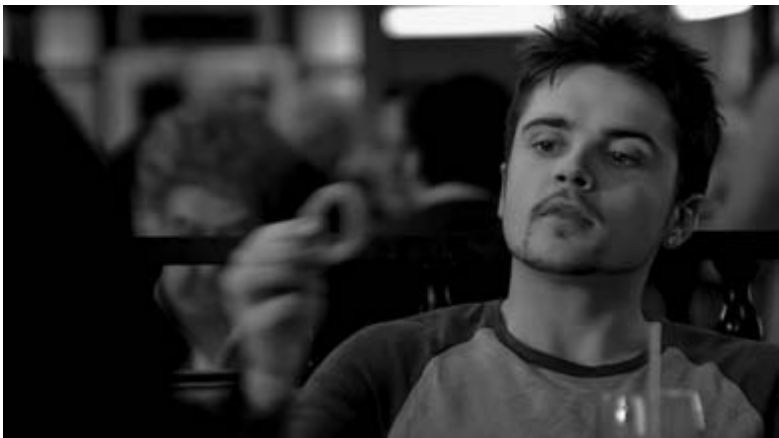
A. J. (Robert Iler) in his last scene in the very last season.