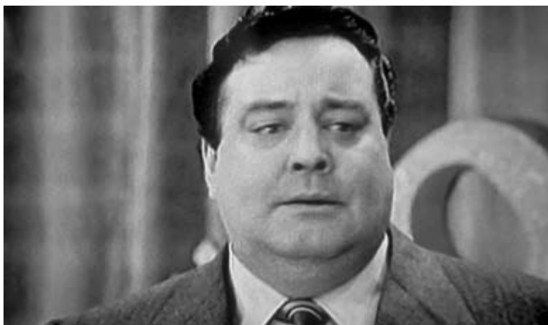
Two successive shots: flummoxed men.