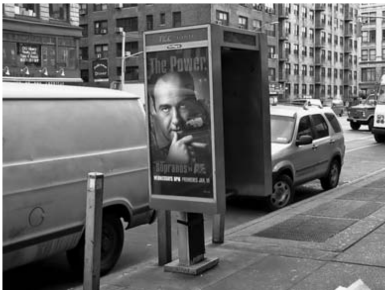
Afterlives: A&E Sopranos .