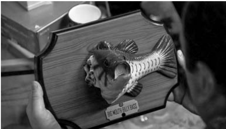
The postmodernist punch line.