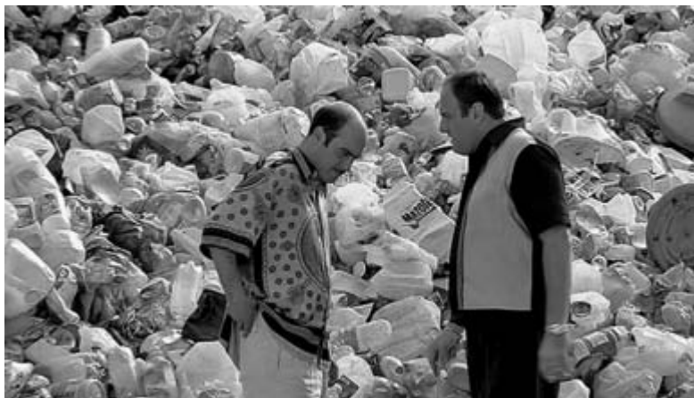
A New Jersey aesthetic? Glimmering garbage.

bage items as shimmering with an intensity of (artificial) colors, as if the world of waste were the most vibrant and visually sublime thing in the otherwise gray environment of strip-mall New Jersey.