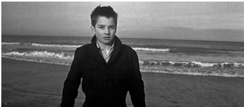
Art cinema freeze-frame: The 400 Blows .

in ambiguities of plot and person alike. Like the foreign art movies, The Sopranos worked with a seemingly popular form of media—in this case, narrative-based television—but opened it up to modes of veritably modernist experimentation. In this respect, the cut to black that concluded the adventures of The Sopranos is like the freeze-frame that ended François Truffaut's The 400 Blows (1959) and left the future of its own delinquent protagonist open-ended.