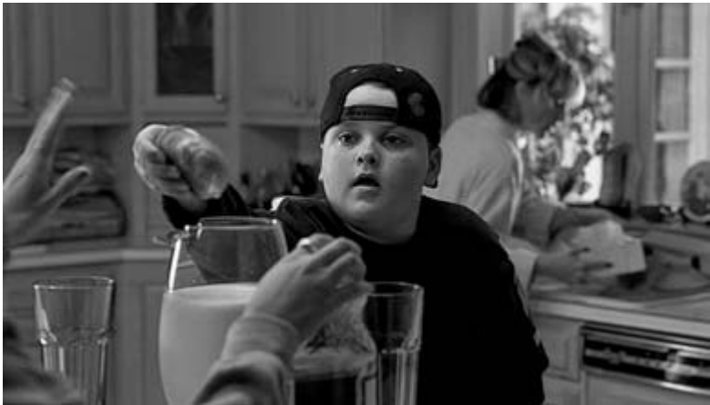
A. J. (Robert Iler) in his first scene in the very first season.