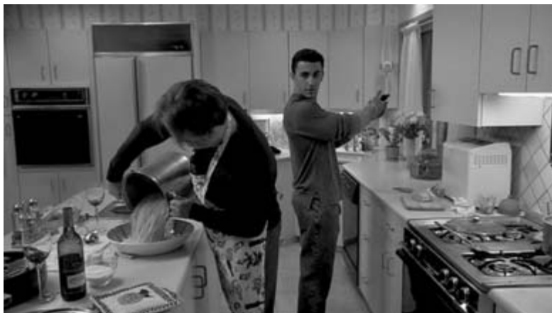
Masculine metrosexuality? Aprons, pasta, and a good gun.