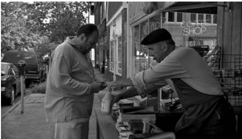
Tony Soprano buys orange juice.