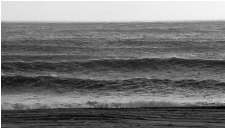
The modernist mystery of waves.