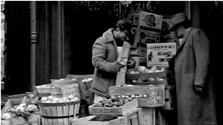
Don Corleone buys oranges.