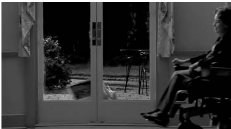
A passing moment.

throws a flat-screen television out of her room at a retirement home, there is a throwaway shot at ground level, as the screen comes crashing down in the background, of an elderly person tooling by unawares in a motorized wheelchair. The vignette is curious and fleeting, and all the more funny for that. It doesn't advance the narrative and seems to have no point other than to add weird levity to the instant.