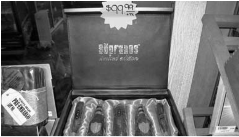
Tie-ins: Sopranos baseball bat and booze-bottle cigars.

dom from The Sopranos : after a minimal two-page introduction in which the editors argue that the yin and yang of Taoism posits a universe of flux in ways that parallel the play with moral opposites in The Sopranos , The Tao of Bada Bing! offers thirty short sections that begin with a brief quotation from the Tao and then excerpt dialogue from the TV series to suggest that each illustrates the other. 1 Strikingly, the publishers of the book (a hitherto minor publishing house that hoped to hit it big when it was licensed to produce this volume for HBO) tried to present the very meagerness of the volume as its virtue. An article in Publishers Weekly noted that publishing executive Charles Kim hoped “fans [would] appreciate the absence of sociological conjecture,” while HBO’s own director of licensing Richard Oren declared the tome superior to the denser HBO volume of collected scripts, since “it’s easier to read and digest the dialogue this way, in the context of supporting various themes.” 2