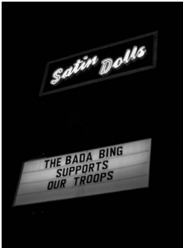
The Bing doing its thing.