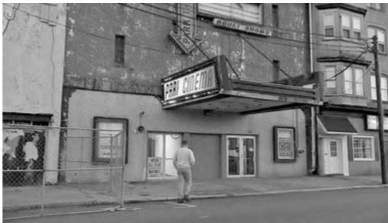
The anonymous spectator in the big city.

films had used their montages to depict immediate actions undertaken by the Michael Corleone Mob against those particular figures who stood directly in the way of its ascent to power, The Sopranos suggests here, in the image of anonymity, a more expansive image of control, one which can go beyond direct influence on identified figures in the immediate orbit of Tony's power to impact ordinary citizens so removed from a direct sphere of action and influence that they remain unidentified in the scene. "I believe in America," the first voice-over in The Godfather had declared, and the fact that the assertion came from a man paying court on Don Corleone (asking him, in particular, for vengeance against the violators of his daughter) had already hinted at the entanglements of criminality and America's foundational identity. But The Sopranos goes further, to offer the image of an everyday life where nothing would not be influenced by market and exploitation. And not just in its criminal moments: when Tony talks, in the famous episode "College," with his daughter Meadow about his being in the Mafia, she replies that it isn't the worst thing, contrasting him favorably with advertisers for the big tobacco companies and with morally dubious corporate lawyers. End-