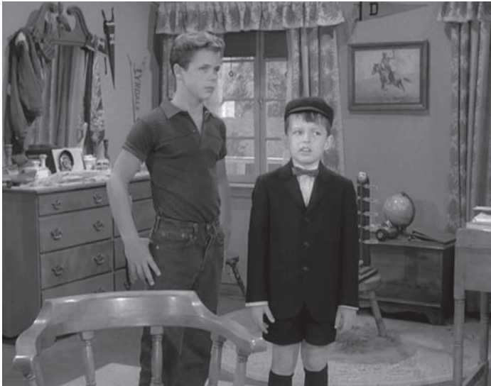
FIGURE 1.1 Clothes unmake and make the man, as evident in Beaver’s queer positioning in relation to Wally (“Beaver’s Short Pants”).