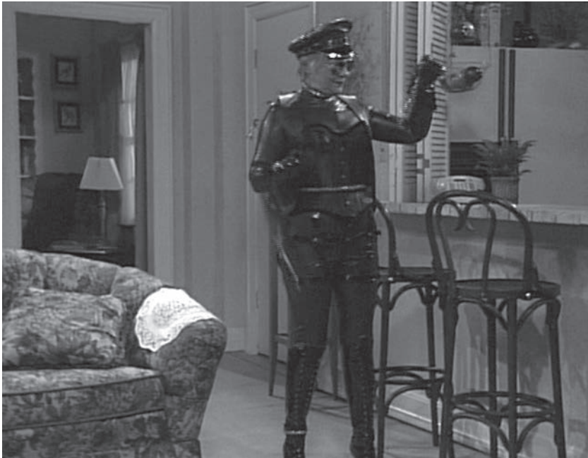
FIGURE 4.4 Bev's sexual desires are staged for humor in this scene ("Body by Jake"), yet her sexual evolution into lesbianism during her twilight years highlights the necessity for women to pursue their true sexual desires.

hadn't either. I wish she had made different choices, so I think that's why I made her gay. I wanted her to have some sense of herself as a woman" ("Into That Good Night, Part 2"). Seeing her mother as economically trapped in a life of erotic malaise, and depicting her socially conservative Republicanism as a denial of her innermost, repressed desires, Roseanne views lesbianism as a narrative solution to the erasure of women's economic and individual autonomy. With Bev as a lesbian, the series suggests, she can also simply be a woman.