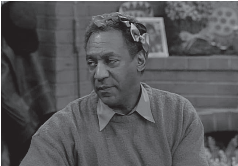
FIGURE 3.1 With red and green ribbons in his hair and a slightly weary yet patient expression on his face, Cosby/Cliff demonstrates his comfort in challenging yesteryear’s conceptions of gender (“Clair’s Reunion”).

Cosby’s deconstruction of Reagan-era masculinity contrasts sharply with the many 1980s sitcom fathers inhabiting hypermasculine roles, including Alex Karras’s retired pro-football player in Webster (1983–89), Bill Kirchenbauer’s high-school gym coach in Just the Ten of Us (1988–90), Gerald McRaney’s marine major in Major Dad (1989–93), and Craig T. Nelson’s university football coach in Coach (1989–97). These characters represent the grouchy yet ultimately cuddly Arnold Schwarzeneggers and Sylvester Stallones of the