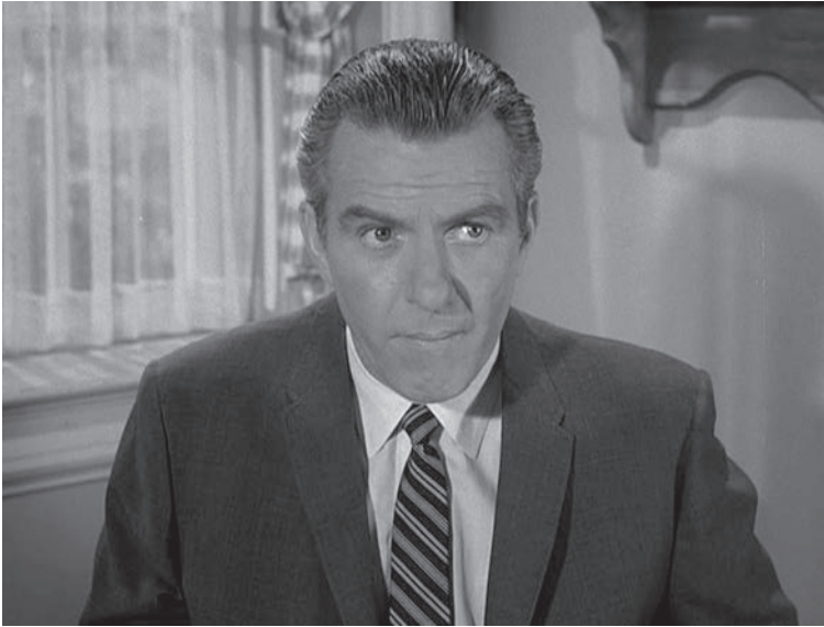
FIGURE 1.2 Ward's reaction shot captures his fear: more than a sissy, his son might just be gay ("Wally's Test").

warmly intones, "and the first time you fall in love, it's not always with a girl," as the camera frames Beaver gazing adoringly at, as the cut reveals, an alligator ("Captain Jack"). Also, planning his future romantic life, Beaver affirms, "But I'm not going to marry any silly girls. I'm going to marry a mother," with his words hinting at his unresolved Oedipal attachment to June ("Dance Contest"). The gaps and fissures of heteronormativity are continually revealed in Beaver's six-year narrative arc, yet even if one concedes that an ultimately conservative and chrononormative vision triumphs, Ward's story line further complicates the notion that "growing sideways" can ever result in an untroubled sense of gendered and erotic wholeness.