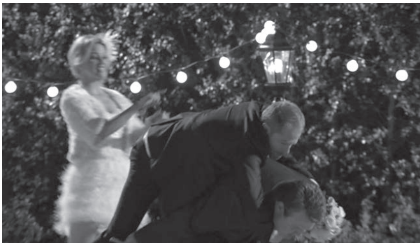
FIGURE 6.3 Mitch wrestles himself atop of Cam as they struggle over Sal's wedding ring. Their positioning, or so she assumes, resolves her long-standing curiosity about their sex life ("Best Men").

to Mitch as "Baby Cub," suggesting her awareness of bear culture ("Great Expectations")—yet this pivotal question of top and bottom has remained unanswered over their many years of friendship. Of course, Sal merely extrapolates the relevance of this happenstance positioning to her friends' sex lives, but her quest for knowledge testifies to the power of the anal imaginary, in that it unleashes tantalizing questions about desire that cannot be readily answered.