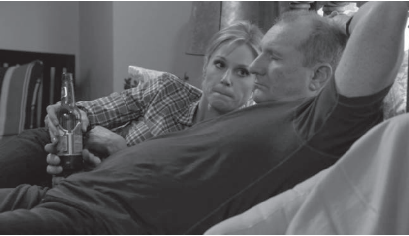
FIGURE 6.8 Claire sips Jay's beer in bed—with incestuous undertones humming throughout the scene.

talking to you online. I think we should become boyfriend and girlfriend.” As his fellow customers look on in horror, he escalates matters by explaining, “Oh, no, it’s not what you think. I’m talking to a little boy” (“The One That Got Away”). Because Cam was born on a Leap Day, he claims his fortieth birthday as his tenth, and after a small squabble, Mitch consoles him—“In fact, you’re still that sexy little eight-year-old I fell in love with”—as a nearby mother shields her child and walks away (“Leap Day”). Pederastic humor is not limited to the gay characters, and when Manny and Jay go to a local courthouse to get a copy of the boy’s birth certificate—on the day that gay marriage has been legalized in California—their conversation unsettles the joyous couples waiting to be wed: