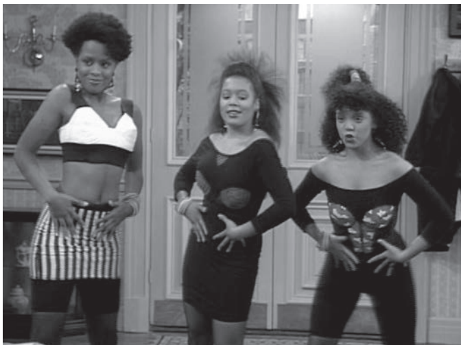
FIGURE 3.4 Modeling the crass sexuality of popular culture, Vanessa forms the singing group The Lipsticks—and meets with her parents’ stern disapproval (“How Do You Get to Carnegie Hall?”).

It is further clear that Cliff’s paternal interest in his daughters’ sex lives revolves around maintaining their virginity until their wedding nights. Before Sondra and Elvin marry, Cliff worries that they are sleeping together after