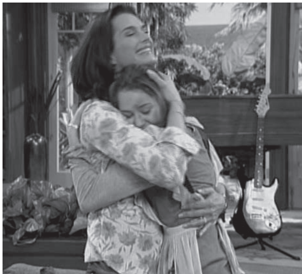
FIGURE 5.4 Brooke Shields, as a sexually suggestive tween in her youth and as Miley’s mother in Hannah Montana , models the recuperation of the sexualized youth in adulthood.