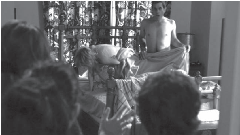
FIGURE 6.7 Like Cam and Mitch, Claire and Phil apparently partake of anal pleasures (“Caught in the Act”).