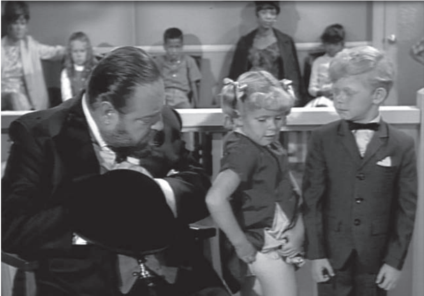
FIGURES 1.1 AND 1.2 Innocent or perverse? Children's nudity registers the fluid vision of cultural innocence, as these images of Buffy in Family Affair attest. Unremarkable in their day, these images, or ones similar to them, simply do not appear in today's family sitcoms.