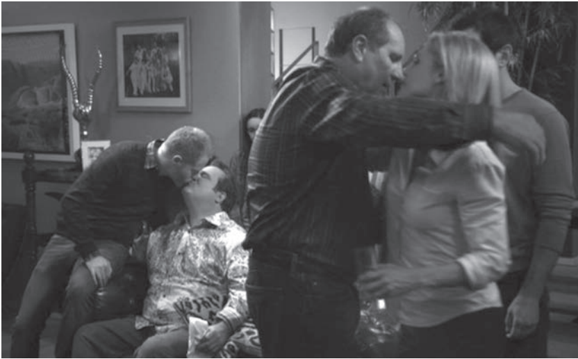
FIGURE 6.2 “The Kiss” episode shows Cam and Mitch kissing and cuddling together, yet even now Jay does not witness their affection.

and its casting of Mitch and Cam as an instructively conservative, long-term gay couple, Modern Family presents a comforting vision of homosexuality for its audiences, one that, in many respects, takes the heterosexual paradigm of marriage as the respected norm. But the confused conflation of marriage with conservatism functions in much the same way as blanket accusations of sitcom conservatism: a genre, I have been arguing, is neither conservative nor progressive but a structural foundation for a story, one that can then be capaciously reimagined for endless permutations, much like the ways in which a marriage represents little more than an agreement between two consenting adults, one that reveals precious little of their political beliefs or any of their amatory practices.