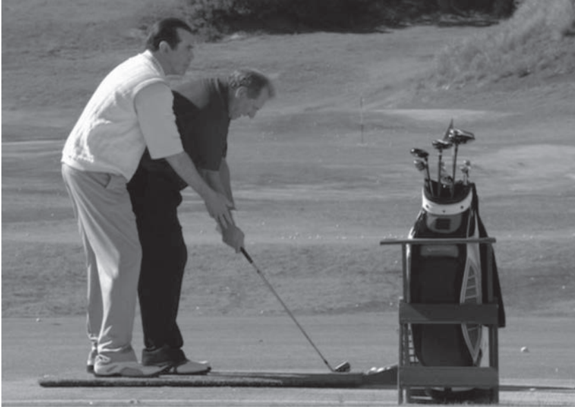
FIGURE 6.5 Shorty helps Jay with his golf swing in “Fifteen Percent.”