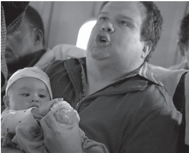
FIGURE 6.1 Mitch interprets homophobia in a woman’s remark about “that baby with those creampuffs,” while viewers see the humor based on the disjunction between the words’ literal meaning and their antigay connotations.

Still, even if one views Mitch’s and Cam’s characterizations, actions, and plotlines as simultaneously bolstering and undercutting tired stereotypes about homosexuality, it is certainly true that, as numerous fans have complained, gay desire is visually absent from the screen, for the two men rarely kiss or display physical affection for each other. To explain this absence, the series pilot informs viewers that Jay does not want to see evidence of the men’s