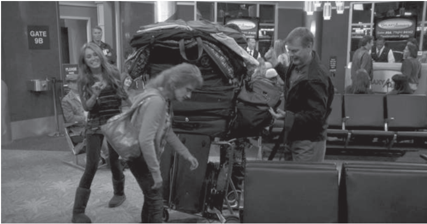
FIGURE 5.3 Luggage conveniently obfuscates teen passion—even in Hannah Montana 's final episode (“Wherever I Go”).