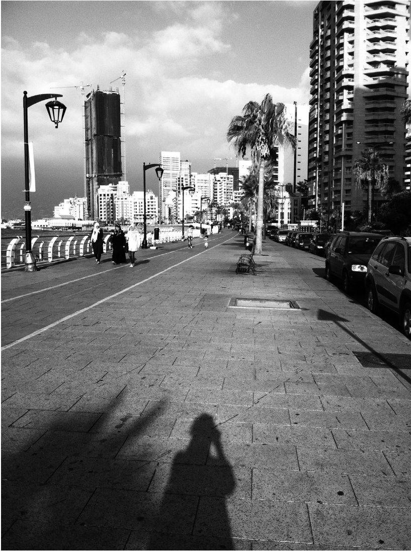
FIGURE 1.4. The Corniche.

parks, 46 the city in fact looks like it perhaps will become less, rather than more, green in the near future: in June 2103, the municipal government announced plans to demolish—and later replace parts of—a park known as the Jesuit Garden in Geitawai, a neighborhood of winding, narrow lanes on the eastern side of the city, in order to build a parking garage. Vigorous