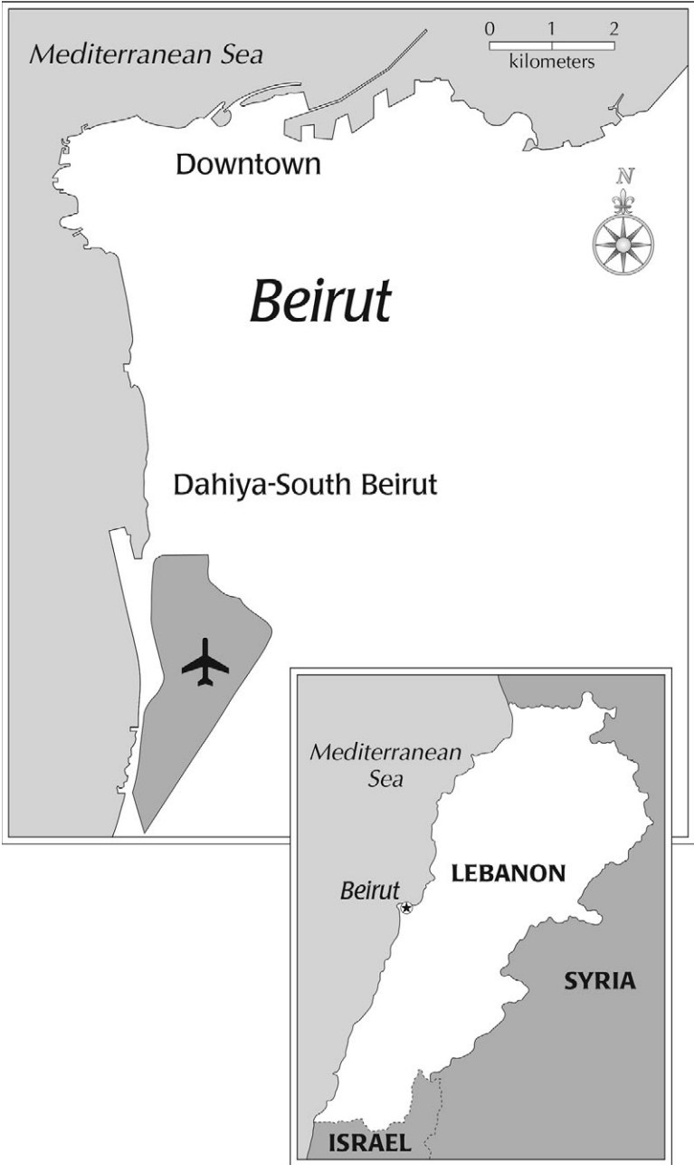
FIGURE 1.1. Map of Beirut in Lebanon and the region.