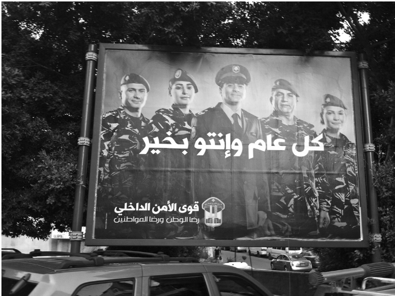
FIGURE 1.1. Internal Security Forces billboard: "Making the nation and the citizens content."

During summer 2013, in the context of a deteriorating domestic security situation because of the spillover from the Syrian civil war, billboards throughout Beirut aimed to send a comforting message about the state's interest in taking care of citizens. The billboards pictured five members of the national police agency, the Internal Security Forces (ISF). The billboard's message was "May you be well and in good health every year," an Arabic sentiment expressed on holidays and special occasions and, below, "Making the nation and the citizens content." With its kind message of well-being and smiling visages of police officers, the billboard cannily personalized and made accessible the state's security apparatus by foregrounding its workforce. This was a strikingly different political sensibility than those expressed by the banners, posters, and images that were draped throughout