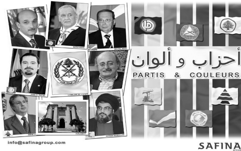
FIGURE 3.1. Lebanese “Parties and Colors” albums and stickers.

suburb” in Arabic), is an assemblage of multiple municipalities and neighborhoods. 13 In the early twentieth century, the land where it is situated was rural, but by 1970 (Deeb 2006, 47) it had become part of Greater Beirut, mainly because of the wave of rural-to-urban migration in the 1950s and 1960s, which I describe in chapter 1. During the years of Lebanon’s war, Shi’i refugees from the northeastern suburbs, the south, and the Bekaa Valley arrived in the area, and these consecutive waves of migration altered the sectarian makeup of the southern suburbs from being a mix of Shi’i Muslims and Maronite Christians to being predominantly Shi’i. Although, in many ways, the neighborhoods in Dahiya are unexceptional, resembling other neighborhoods in Beirut, especially working-class ones, the area is set apart by its population density and the morphology of the built environment. 14 Although, as Mona Harb writes, Dahiya is just another Beirut neighborhood managed “by a sect-based political actor,” by reserving for itself the right of armed resistance to Israel—a claim some Lebanese see as a threat to the legitimacy of the state—the group constitutes the southern suburbs as a realm distinct not only from other parts of Beirut but from the rest of Lebanon (Harb 2007, 13).