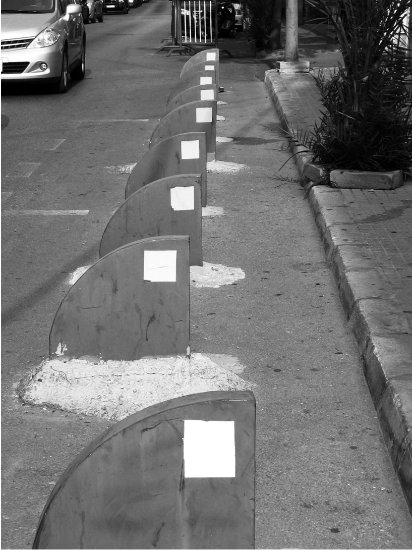
FIGURE 4.1. Shark-fin barriers.

the impromptu aspects of security. Typically consisting of black SUVs with blacked-out windows that often bear no license plates, the convoys are only sometimes led by a police vehicle with flashing lights or a siren. More often, they appear without warning to take over the field of drivers. Thundering past motorists frantically trying to get out of their way, the convoys activate