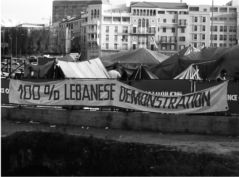
FIGURE 2.1. Tent City: Downtown protestors demand the truth about who killed Hariri and independence from Syrian control, spring 2005.

assassination in front of the seaside Phoenicia Hotel on February 14, 2005, Hariri was buried downtown across from a vacant area known as Martyrs' Square, where a statue that commemorates the nationalists hanged by the Ottoman Turks in the early twentieth century is situated. From the time of his funeral and for months afterward, a line of people wanting to visit his burial site extended out into the street, and Martyrs' Square became a tent city for demonstrators with signs demanding al-haqeeqa (the truth) about the identity of Hariri's assassin. 39