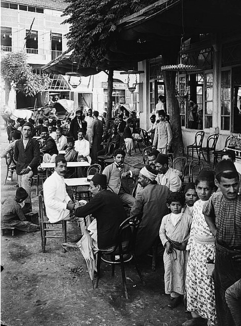
FIGURE 1.3. Cafe at a Beirut public garden during the late Ottoman period, ca. 1900–1920.

class-based lines. With the appearance of these kinds of places, the removal of its medieval city walls, and its newfound status as an imperial capital, Beirut changed profoundly during the late Ottoman period; a modern city was inaugurated, one characterized by a vibrant, middle-class public sphere.