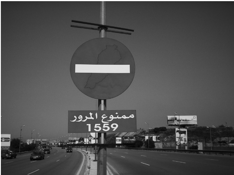
FIGURE 3.2. Traffic sign: “No foreign intervention! 1559 prohibited from passing.”

In March 2005, amid the heated contention between the just-formed March 8th and March 14th political camps, I took a taxi out toward the airport to see traffic signs that had appeared overnight along the median of the highway. They were, in fact, faux traffic signs that used the commonly recognized symbols and vocabulary of traffic control to express political sentiments