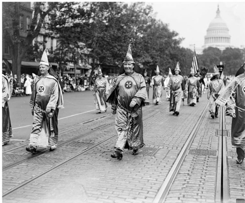
FIGURE 4. Ku Klux Klan parade, September 13, 1926.