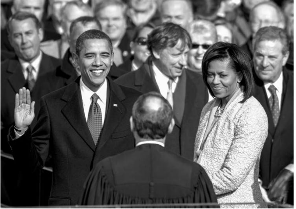
FIGURE 13. Barack Obama takes the oath of office and is sworn in as the 44th president of the United States next to his wife, Michelle Obama, by chief justice of the United States John G. Roberts Jr. in Washington, DC, January 20, 2009.