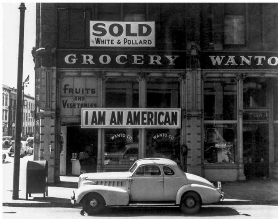
FIGURE 6. Photograph by Dorothea Lange depicting a store owned by a Japanese American in Oakland, California, March 1942. This “I am an American” sign appeared on December 8, 1941, one day after Pearl Harbor was bombed by the Japanese.