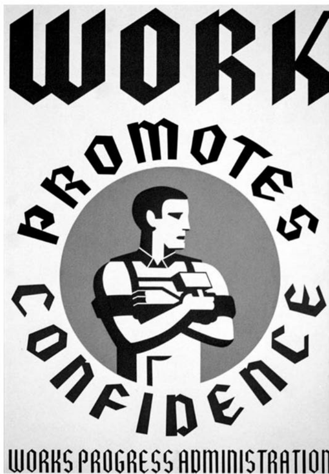
FIGURE 5. "Work Promotes Confidence," poster from the Works Progress Administration, ca. 1936–1941.