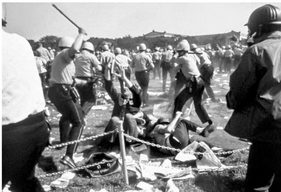
FIGURE 10. Grant Park, Chicago, 1968.