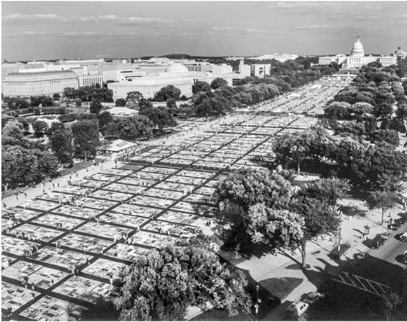
FIGURE 11. Aerial photo by Paul Margolies of the AIDS Memorial Quilt, National Mall, Washington, DC, 1996. Photo Courtesy of The NAMES Project.

Viguerie argued that “family” issues were the engine propelling the rise of the New Right. “Conservatives can win,” he predicted, “when they’re fighting for traditional family values.”