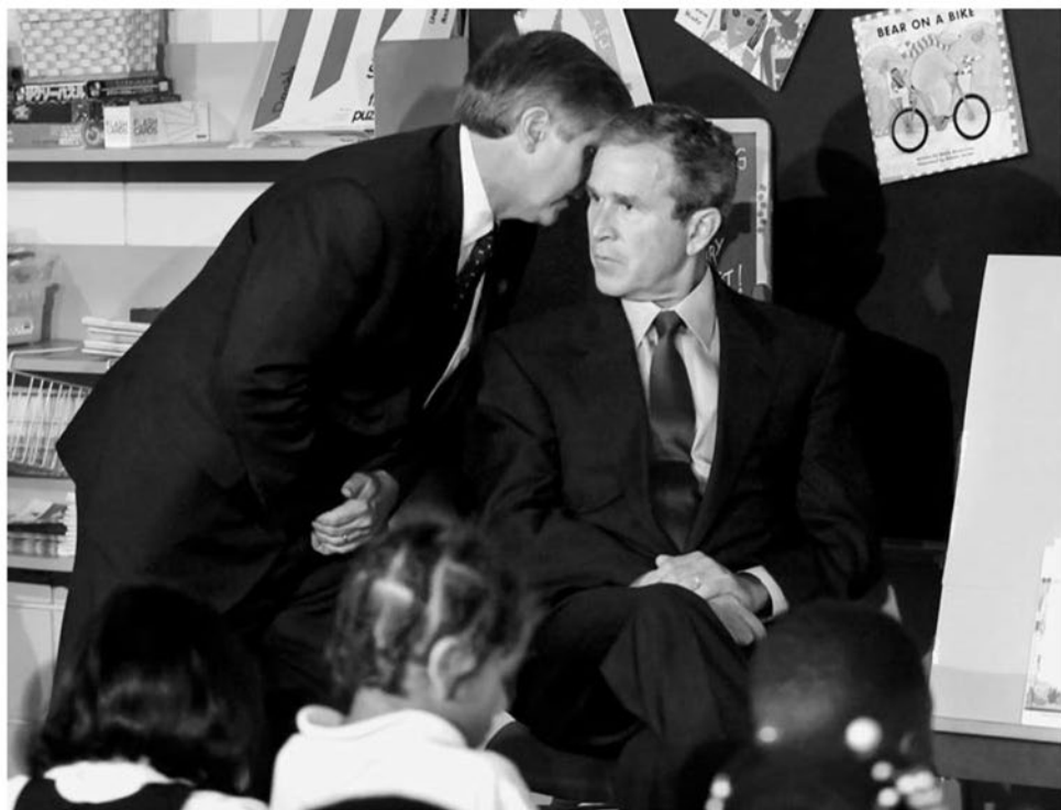
FIGURE 12. While US president George W. Bush conducts a reading seminar at the Emma E. Booker Elementary School in Sarasota, Florida, on September 11, 2001, White House chief of staff Andrew Card informs him of a second plane hitting the World Trade Center in New York City.