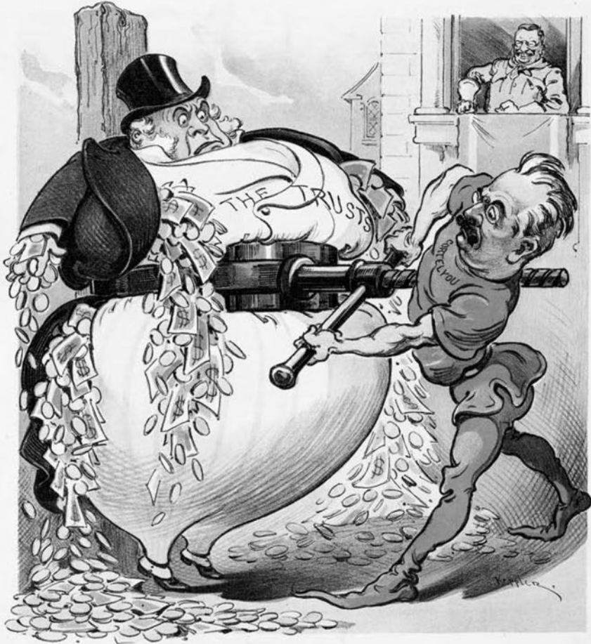
PUTTING THE SCREWS ON HIM.

Entered at N. Y. P. O. as Second-class Mail Matter.